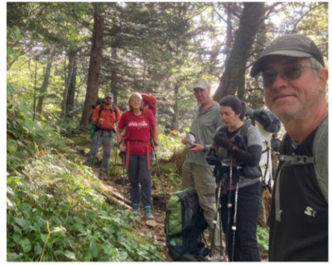
OCTOBER 9, 2021 JOHN MUIR TRAIL WORKTRIP AND CLEANUP