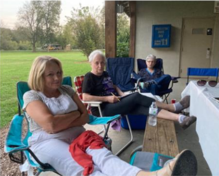
OCT 14, 2021 MONTHLY CLUB MEETING